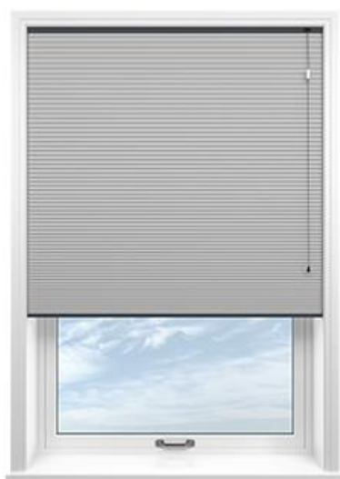
Corded – Standard

Frame colours are available in White, Anthracite or Silver.