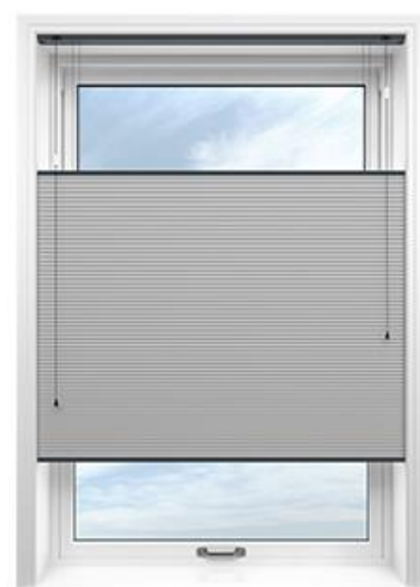
Corded – Top Down, Bottom Up

Standard (Bottom up) system is available at these sizes - 300mm - 2100mm drop & 500mm - 2200mm width.