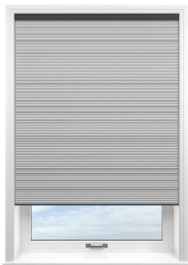
Cordless – Standard

Frame colours are available in White, Anthracite or Silver.